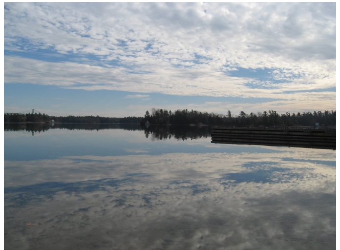
Photo of a St. Lawrence River inlet 40 minutes east of our Kingston office.

I promise not to clog up your inbox on a weekly basis with "shameless self-promotion" - in fact, we'll be lucky to get 3 of these newsletters out a year, so no worries on that front. Now as a reward for reading this far, here is a recently-revised clearance guideline freebie, related to the use of actual North American currency onscreen: "Spokespersons for both the U.S. and Canadian government offices that oversee currency reproduction enforcement indicate that there are no legal restrictions on videotaping or filming actual currency (paper or coin) for projection on-screen. If your intent is to make your own currency for use on set, there will be restrictions on how that can be done (please advise if you need further guidance for that scenario)." [We guarantee at least one such free gift per newsletter.]